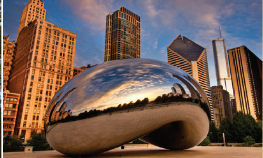
Downtown Chicago, Illinois

The campus is located in a residential neighborhood of Naperville, Illinois—a city ranked one of the safest places to live in the US.