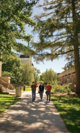
Scenic North Central campus Naperville, Illinois

The campus is located in a residential neighborhood of Naperville, Illinois—a city ranked one of the safest places to live in the US.