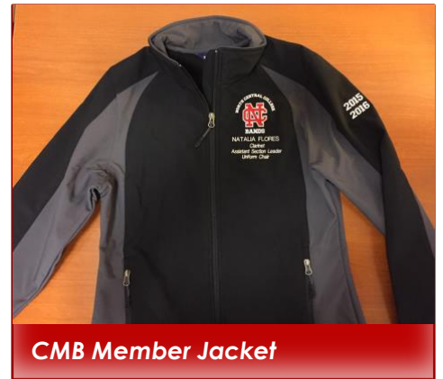
CMB Member Jacket

Students will be provided with a minimum of 15 minutes between pregame activities and the national anthem performance in order to take care of any personal concerns, including eating a snack, using the restroom, etc. Please make sure that you have taken care of all of these issues prior to the announced report time.