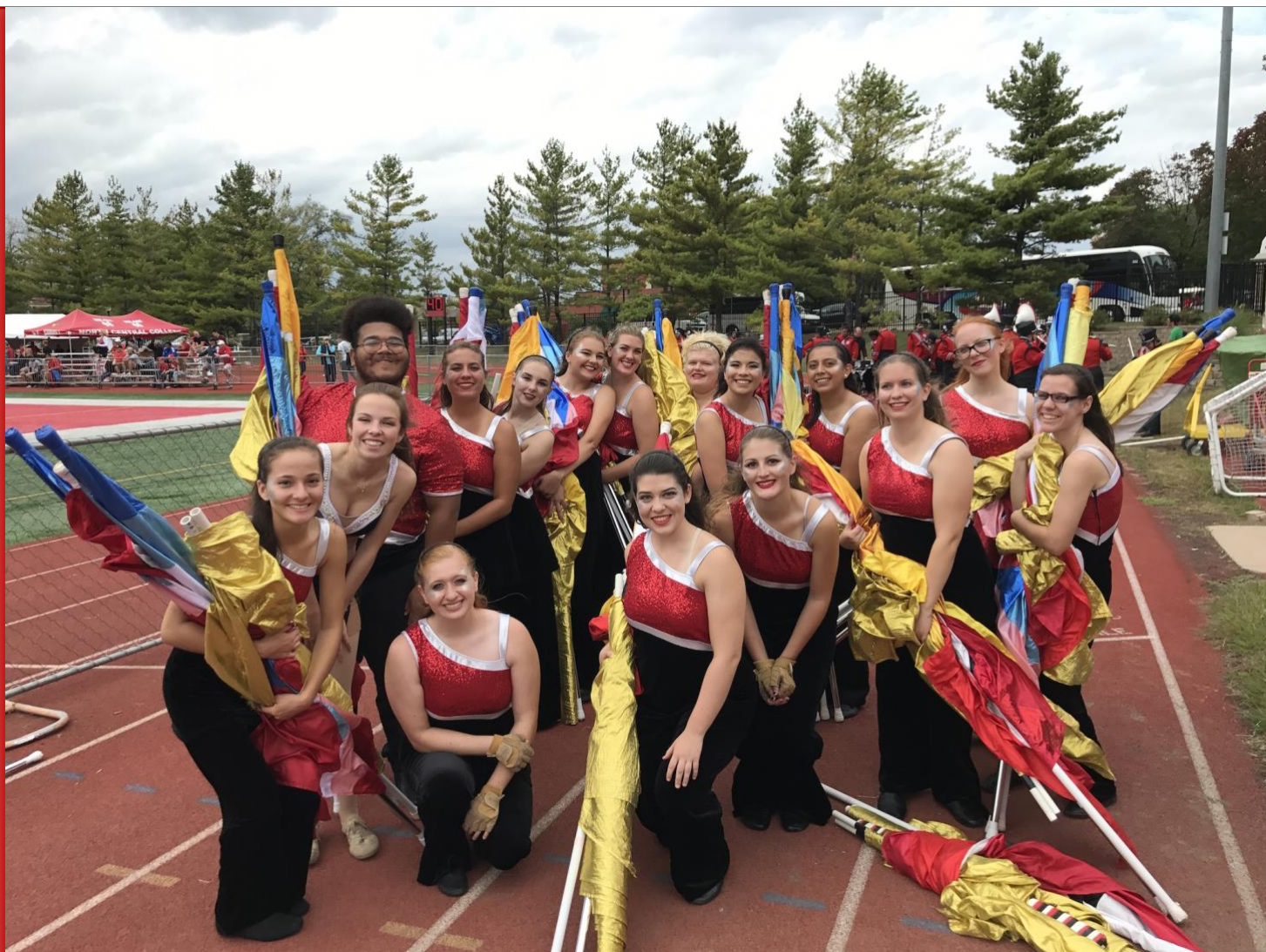
The 2017 Cardinal Color Guard

The end of the fall Semester is a very busy one for the CAB. Final exams and projects, the football playoff schedule, and the beginning of basketball season all coincide at the end of November. Please keep this in mind as you prepare for finals, plan for Thanksgiving, and make plans for D-Semester.