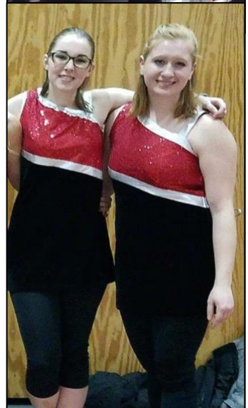
Top to Bottom: Formal Instrumental Uniform, Informal Instrumental Uniform, Color Guard Uniform