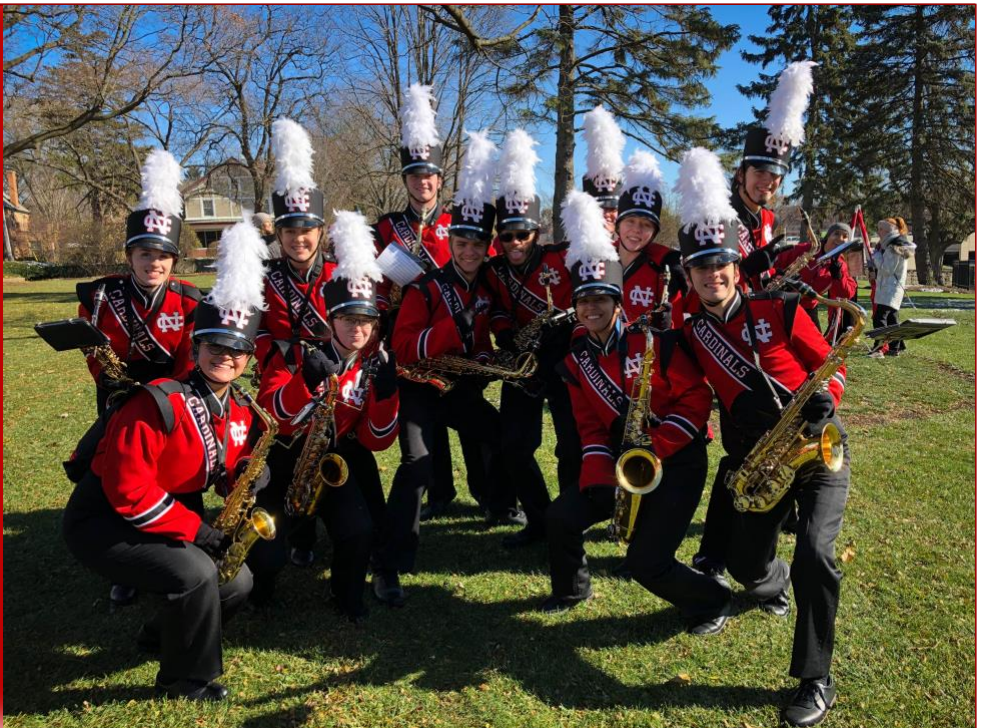
The 2018 Saxophone Section

Due to the hectic schedules, our focus during the Fall Semester centers on morale. Each Thursday, we dedicate part of our rehearsal to taking a few moments to appreciate our time together through purposeful fun games and activities. These activities are led by our Band Relations committee.