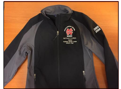
CMB Member Jacket

Students will be provided with a minimum of 15 minutes between pregame activities and the national anthem performance in order to take care of any personal concerns, including eating a snack, using the restroom, etc. Please make sure that you have taken care of all of these issues prior to the announced report time.